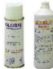
10- Spray paint