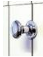
237 - hanging peg white