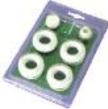
43- Reduction kit 3/8" with silicon gasket for model from 200/D to 800 mm