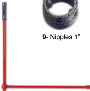
79- Lever for spanner