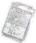
27- White universal bracket blister (two)